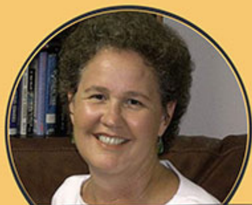
Our Guest: Linda Darling Hammond

DonorsChoose.org Teachers ask. You choose. Students learn.